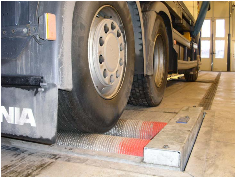
Figure 3 – Roller brake test on heavy truck

XTB is carried out at workshops in accordance with the Swedish Motor Vehicle Inspection test programme approx. 6 months before the annual inspection and also comprises, once per year, start pressure, which in the trailer brake control pipe (duo-matic) must be between 0.5 – 0.8 bar and max 0.7 bar in the brake cylinders. Approved vehicles receive an XTB decal at the workshop and again at the annual inspection.