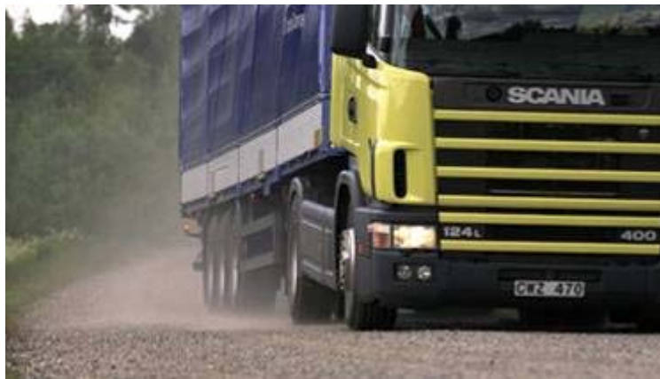
Figure 4 – New vehicles’ brakes are approved and a certificate is issued stating that the legal requirements have been met.

encourage drivers to brake occasionally in wet conditions to keep brakes working efficiently. There should be no such need to use the brakes to keep them working efficiently. Brakes should perform within satisfactory margins in all driving conditions.