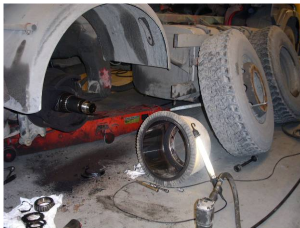
Figure 1 – Maintenance of drum brakes on a heavy truck