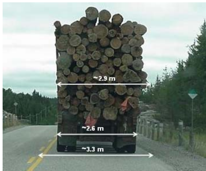
Figure 3 – Width of Load Exceeds the Allowable Width.

The maximum allowable width of highway vehicles is 2.8 m for tractors (rear vision mirrors and lamps may extend in whole or in part beyond either side of the vehicle) and 2.6 m for a load on the vehicle (HTA, 2000). However, for loads of raw forest products, the maximum allowable total load width is 2.7 m at point of origin and 2.8 m at any time during transit (Figure 3). In addition, the load covering mechanism may further extend the width of the vehicle on either side by more than 102 millimetres.