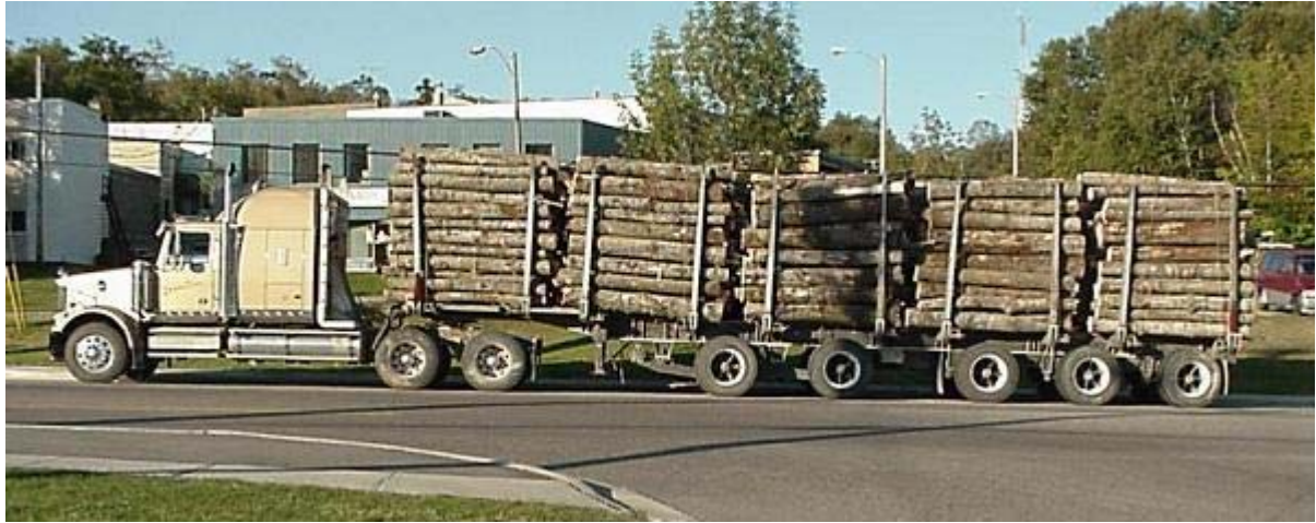
Figure 2 – Logging Truck, Loaded With 8-Foot (2.4 m) logs.