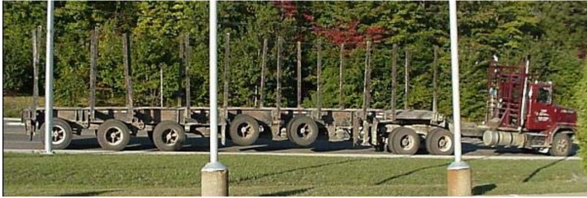
Figure 1 – Empty Logging Truck Consisting of a 3-Axle Tractor with a 5-Axle Semitrailer. The First Two Axles on the Semitrailer are Lifted.